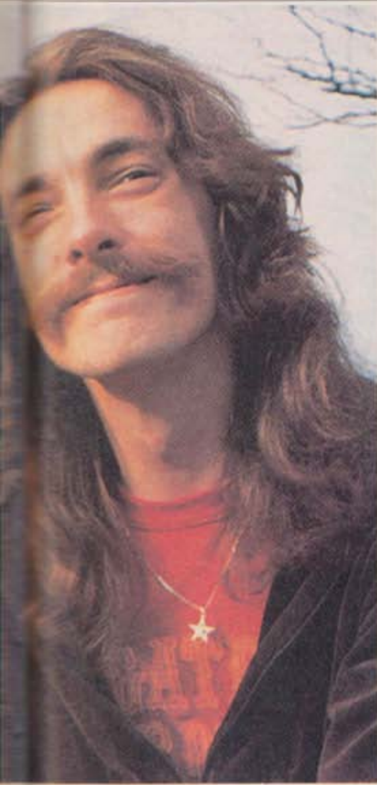
Geddy "The Growler" Lee, Alex Lifeson and Neil Peart are Canada's gift to heavy metal.

there's one science fiction epic on the album called "Sigma Tech One" and the root for that came from Time magazine. I was reading Time magazine and they were talking about black holes and their approximate origin and I built a song around it.