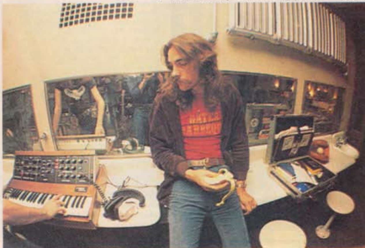
Neil Peart is the versatile drummer and expansive lyricist responsible for Rush's forays into epic rock concepts rooted in 4/4 time. They've replaced BTO as Canada's major force in rock.