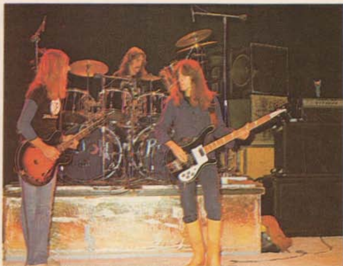
Alex Lifeson and Geddy "The Growler" Lee round out the Rush trio.