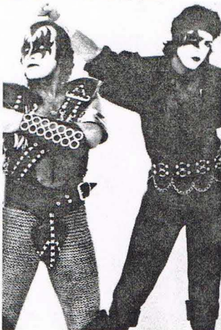
Kiss tells all, p.36