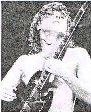
AC/DC in the '80s, p.24