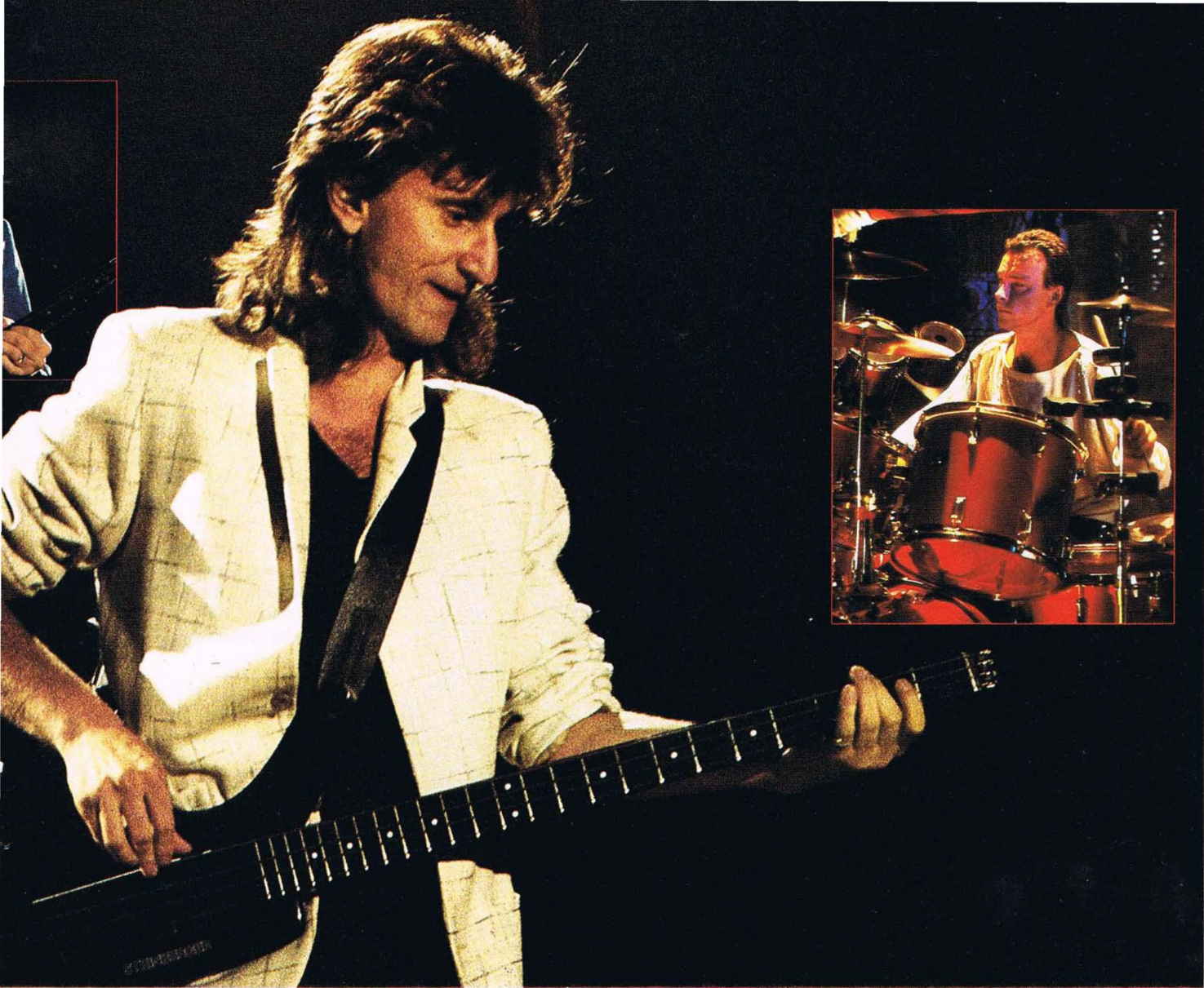
Rush: (inset left) guitarist Alex Lifeson, (center) frontman and bassist Geddy Lee, and (inset right) drummer Neal Peart

rarely has yielded even the remotely personal or strayed too far from anything musical. And the band's desire to keep things that way was made very plain by Rush's road manager, who warned that asking Lee what he wears to bed would be an immediate interview ender.