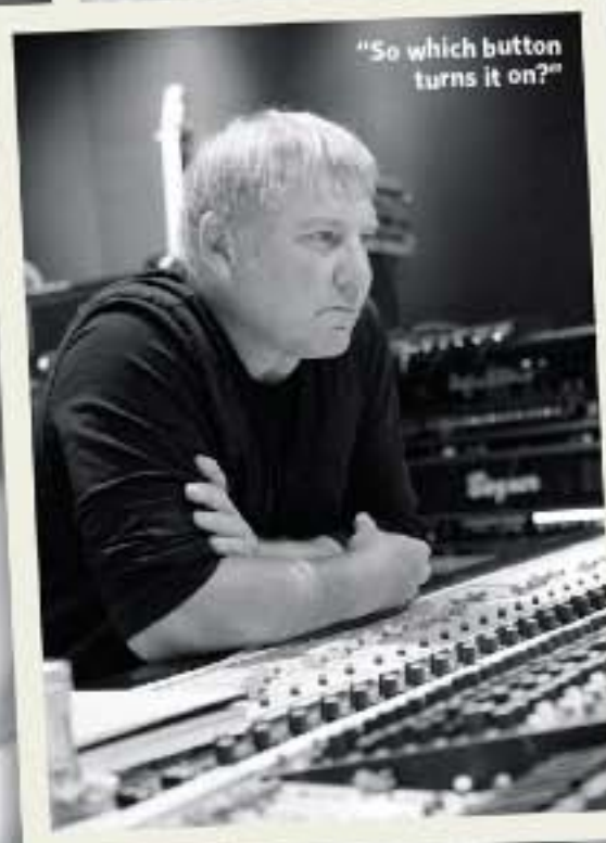
"So which button turns it on?"