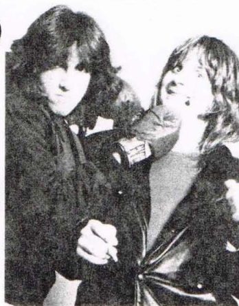
Ozzy Osbourne's travels, p. 25