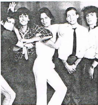
Rolling Stones mouth off, p. 26

46 Rush & Foghat In the super mini-tour of '76, two hard-rock rivals shared the same boards